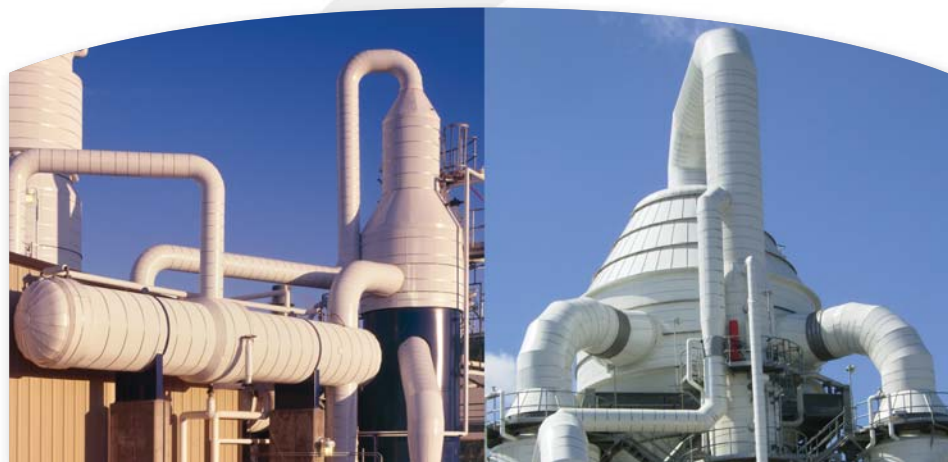
HPD's unique CoLD™ Process uses evaporation and low-temperature crystallization to eliminate wastewater discharge from coal-fired power plants

Flue Gas Desulfurization (FGD) and Integrated Gasification Combined Cycle (IGCC) processes produce large volumes of saline wastewater containing toxic and hazardous constituents. Physical, chemical, and biological treatment methods can reduce the concentrations of these pollutants, but the volume and salinity of the wastewater is unchanged. Evaporation and crystallization, a proven method of treating these wastewaters, have been used for over forty years in the power industry to achieve zero liquid discharge (ZLD).